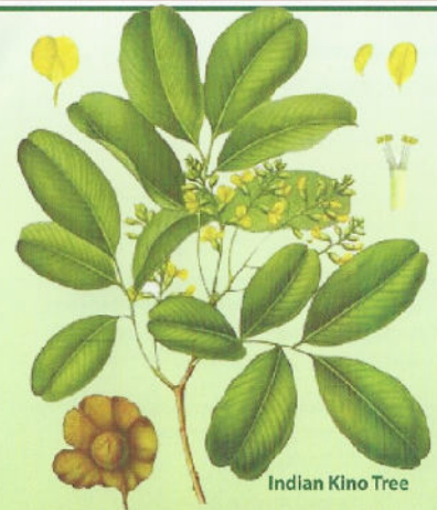
Indian Kino Tree

No adverse/toxic effects have been observed in short/long term usage of Dia-TONIC Incudil in recommended dosage. But if you do experience any nausea, vomiting or diarrhea, you may reduce dosage of Dia-TONIC Incudil for 2-3 days; or try diluting it with water.